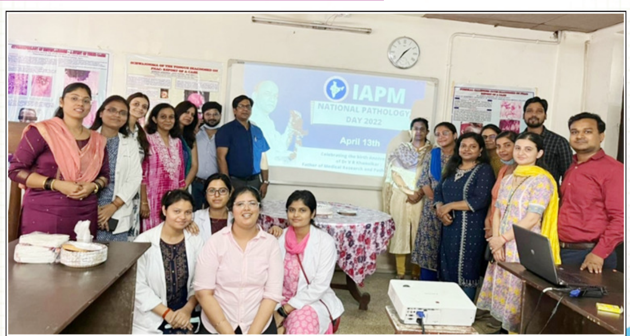
"National Pathology Day 2022" Celebration at S. N. Medical College, Agra

1<sup>st</sup> National Pathology Day 2022" celebration on 13th April (Virtual)